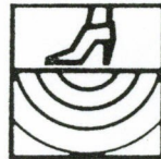
GREATER WALKING COMFORT